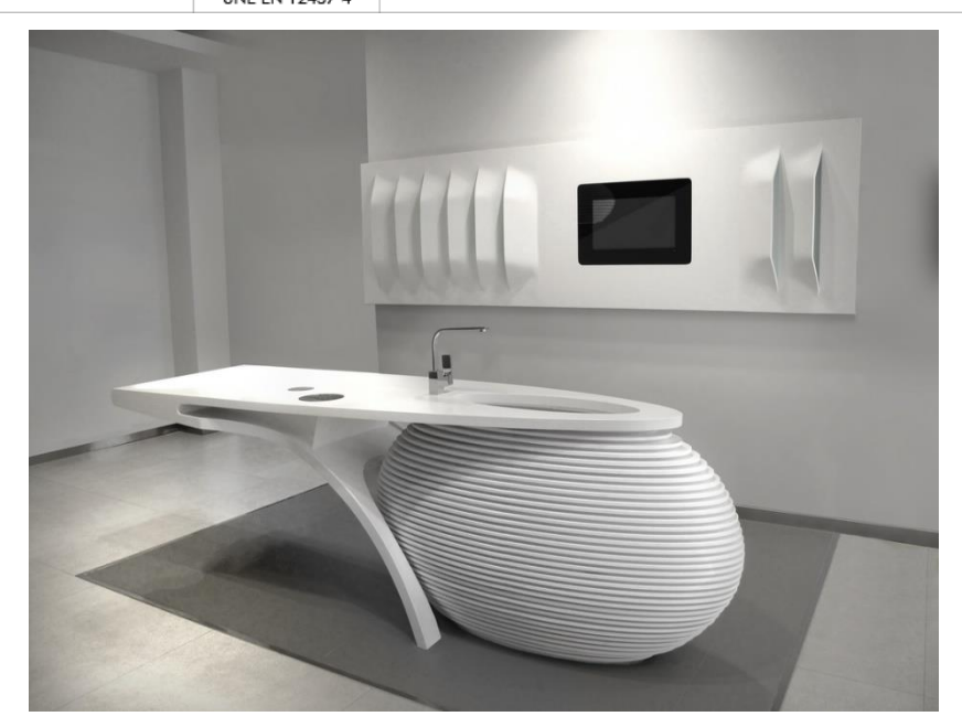
\textbf{Ilustration 1.} \ \mathsf{KRION}^{\$} \ \mathsf{EAST}^{\$} \ \mathsf{K-LIFE} \ \mathsf{Porcelanosa} \ \mathsf{Solid} \ \mathsf{Surface.} \ \mathsf{Furniture}.