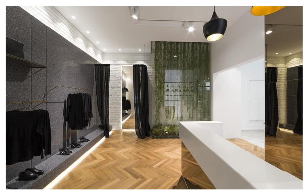
Ilustration 1. KRION® EAST® K-LIFE Porcelanosa Solid Surface. Interior cladding.