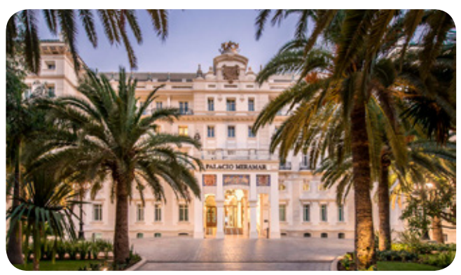
NH Palacio Miramar Málaga

Our extensive collections are as diverse as the tastes of our customers and allow the creation of any style and design in the bathroom: unique and personal, a combination which is always perfect and harmonious. Noken bathroom fittings are present where quality design and respectful water use are considered fundamental values.