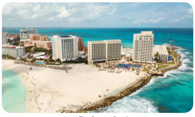
Hyatt Ziva Cancun Cancún