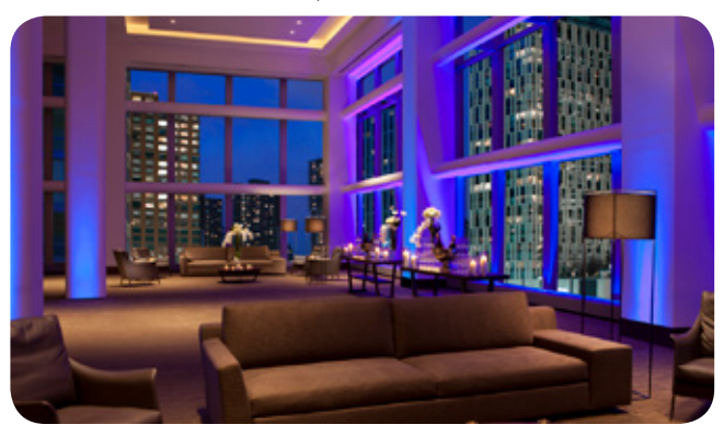
Conrad New York