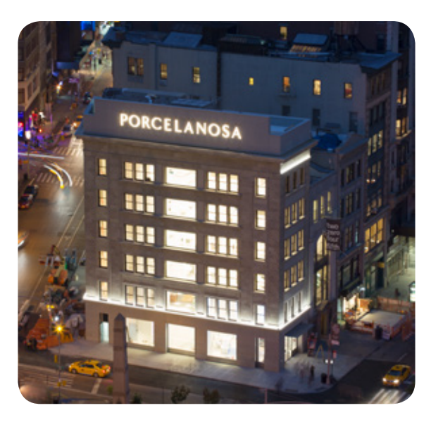
Foster + Partners