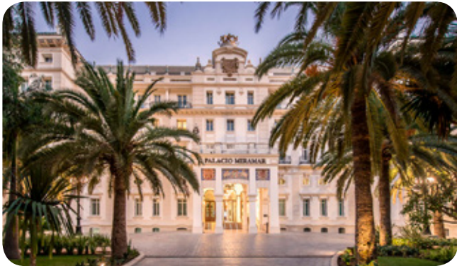
NH Palacio Miramar Málaga

Our extensive collections are as diverse as the tastes of our customers and allow the creation of any style and design in the bathroom: unique and personal, a combination which is always perfect and harmonious. Noken bathroom fittings are present where quality design and respectful water use are considered fundamental values.