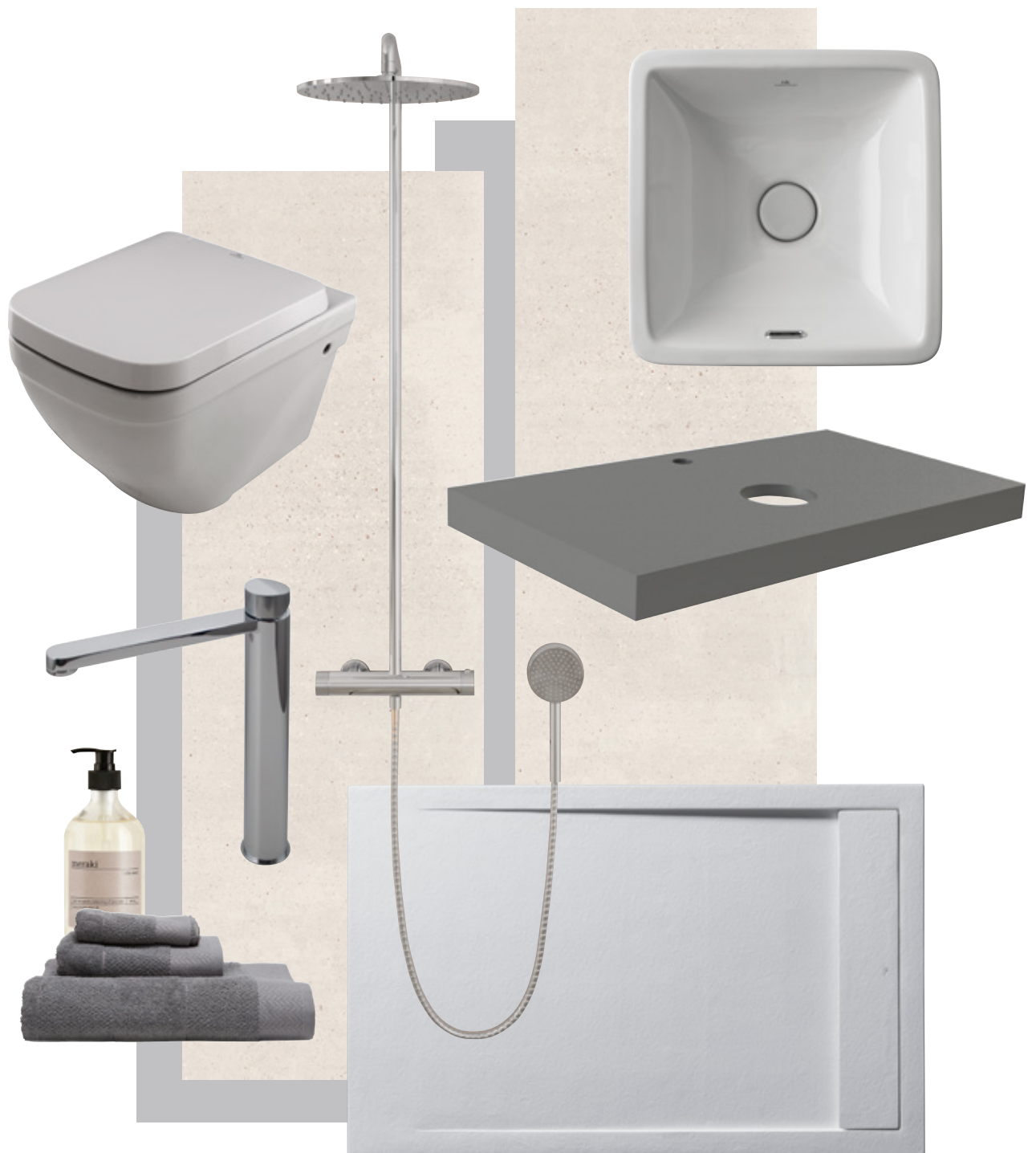
PROJECT TECH Worktop / TONO High spout single lever basin mixer / FORMA RETTO Countertop basin / LOUNGE Mirror / NK CONCEPT Wall hung pan / TONO shower column / LIGHT STONE SERIES shower tray