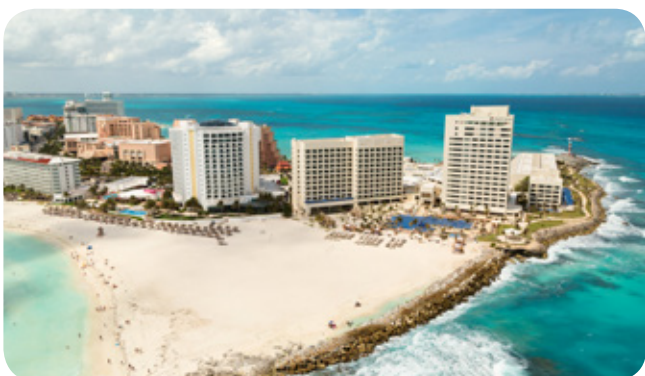
Hyatt Ziva Cancun Cancún