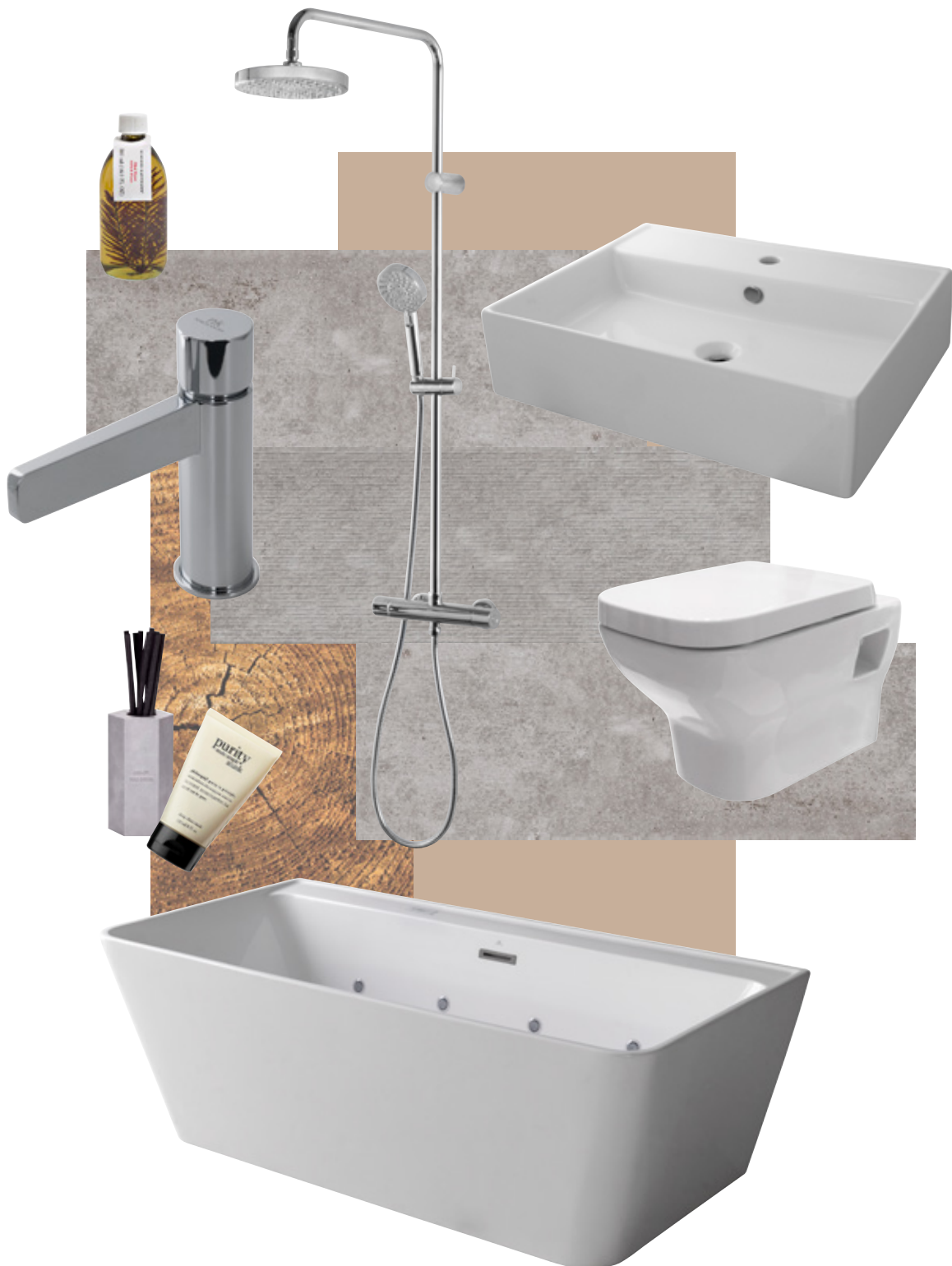
PURE LINE WOOD floor mounted vanity / PURE LINE wall hung thin basin / PURE LINE WOOD mirror with light and shelf / URBAN C wall hung pan / PURE LINE single lever basin mixer / PURE LINE freestanding bathtub / SMART Thermostatic shower column