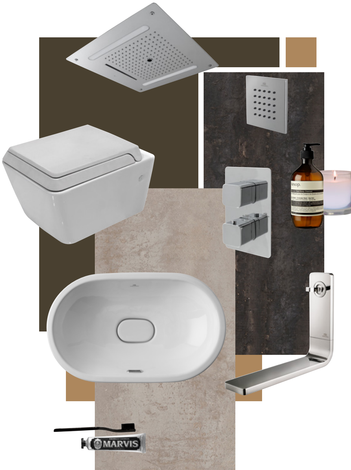
LOUNGE Shower composition / SOLEIL SQUARE Bath / LOUNGE wall hung pan / LOUNGE Concealed ceiling shower head / LOUNGE Thermostatic / FORMA OVAL Recessed basin / LOUNGE Wall mounted basin mixer / SMART LINE Mirror