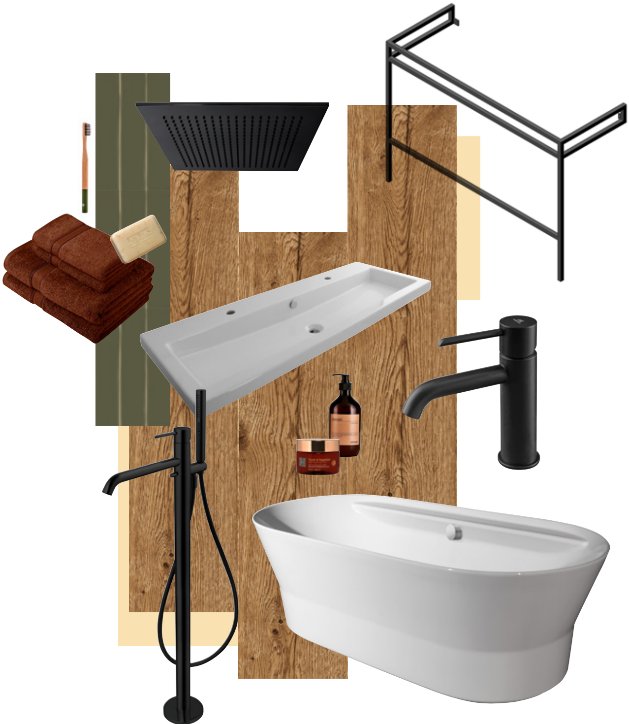
SQUARE Metal black matte console / ROUND single lever basin mixer / SQUARE wall hung basin / ROUND freestanding tub filler / TONO freestanding bathtub / SQUARE Rain shower head / ARQUITECT C/C pan / ARQUITECT Bidet