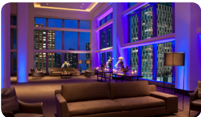
Conrad New York