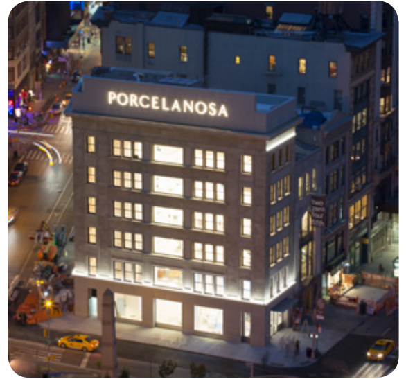
Foster + Partners