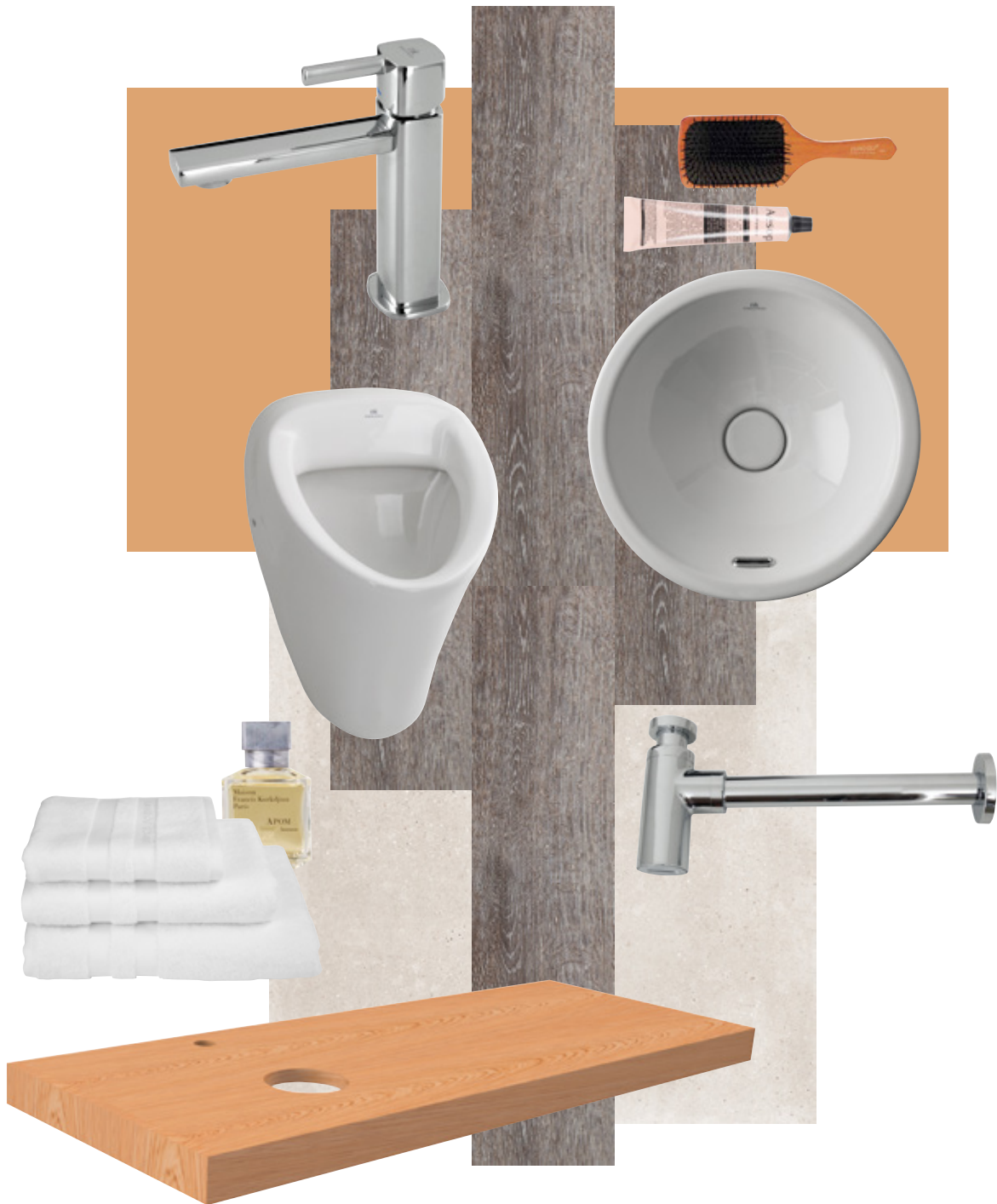
PROJECT WOOD Worktop / FORMA RONDO Countertop basin / NK CONCEPT High spout single lever basin mixer / HOTELS bottle trap / SMART LINE Mirror / ACRO Urinal