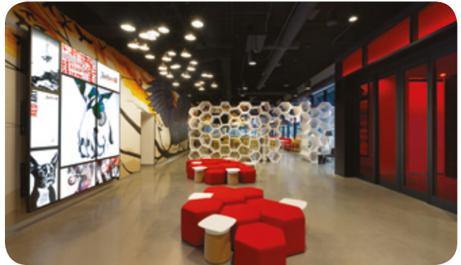
Radisson Red Minneapolis