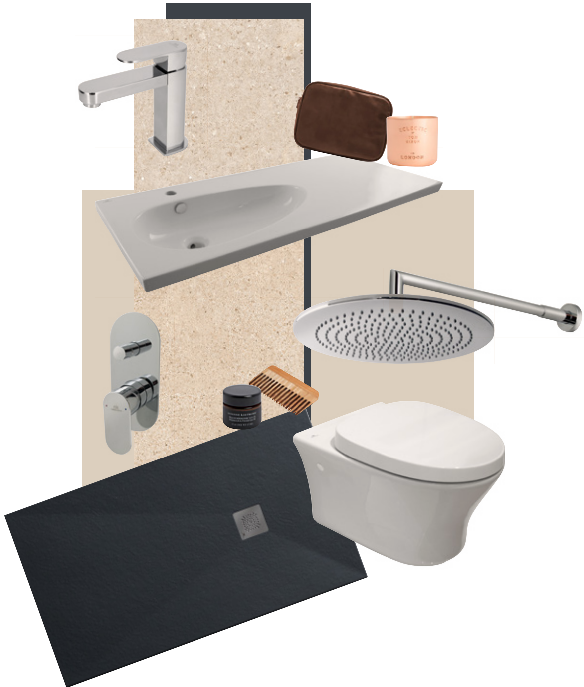
HOTELS Wall hung pan / MINIMAL wall bracket with outlet elbow / HOTELS handshower / RONDO shower head arm ceiling mounted / HOTELS Single lever concealed bath shower mixer / NEPTUNE SLIM RONDO Rain shower head / HOTELS Wall hung basin / HOTELS Wood legs / HOTELS Single lever basin mixer / HOTELS Mirror with light strip illuminated by LEDs / HOTELS bottle trap / MINERAL STONE SERIES shower tray