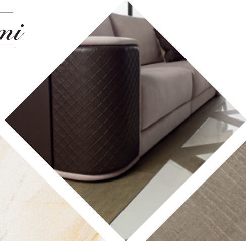
OXFORD CASTAÑO 14,3x90cm