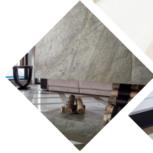
CALACATA GOLD PULIDO 59,6x59,6cm